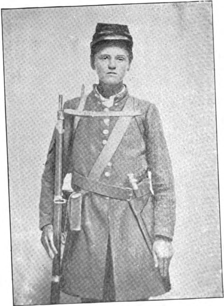
A VOLUNTEER OF '61. [Copied from Life.]